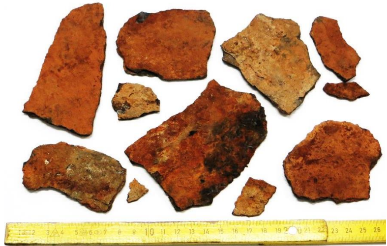
Figure 1: deposits removed from the system