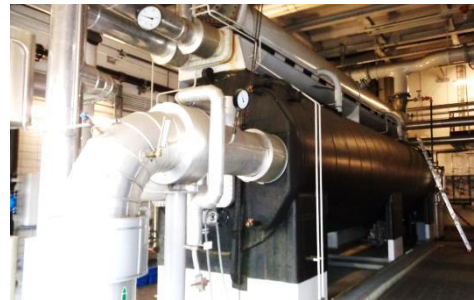
Figure 2: absorber (Shell and tube heat exchanger) in cooling center