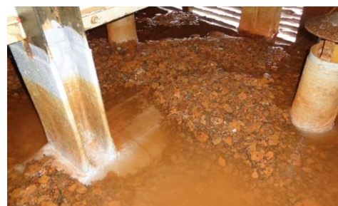
Figure 4: discharge of air, water and removed deposits into cooling tower pond